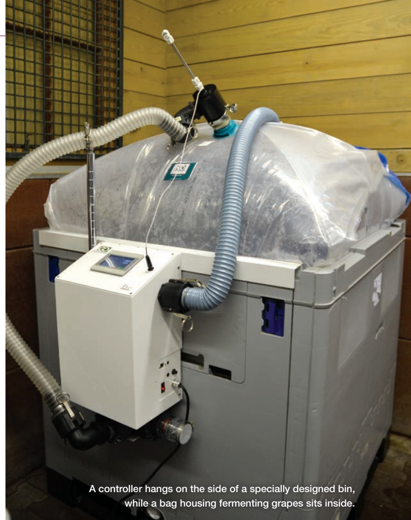
A controller hangs on the side of a specially designed bin, while a bag housing fermenting grapes sits inside.

Small wineries have multitudinous obstacles when making high-quality wines. In many respects, as home winemakers who have become commercial winemakers will attest, it is easier to make 5,000 gallons of quality wine than it is to make 5 gallons. So much of wine-making is influenced by scale. The smaller the vessel in which wine is produced and stored until bottling, the more the negative influences (such as oxygen) can detract from the quality of the wine. It has to do with surface-to-volume ratios, the opening and closing of the vessel and many other factors. For example, it takes the same amount of time to open a 5-gallon vessel, remove a sample for analysis and close the container as it does to open and close a 5,000-gallon vessel. But the impact on the wine is many times greater in the 5-gallon vessel.