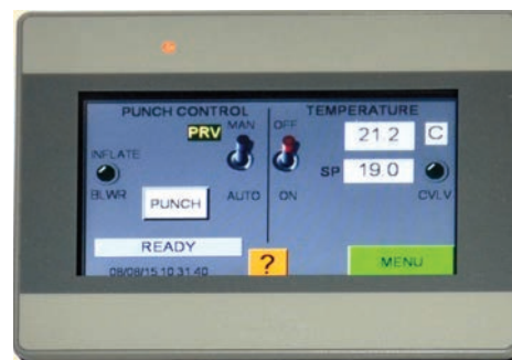
An LED screen allows winemakers to input operating instructions such as temperature and timing of pumpovers.

Flexibility: The quantity of fruit at harvest is never completely predictable. GOfermentor bags give winemakers containers to ferment